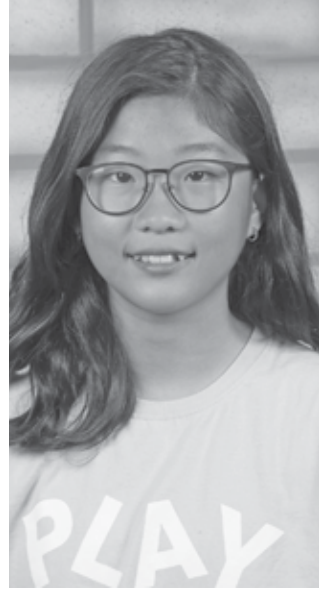
CONTRIBUTED PHOTO Katie Choi