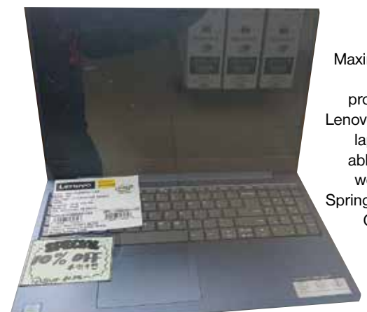
Maximize work or school projects with Lenovo Ideapad laptop available at Sherwood at the Springs Plaza in Gualo Rai.