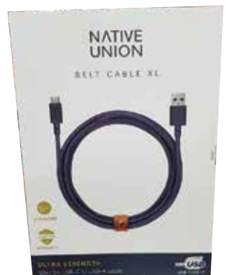
Native Union Cable is a tangle-free and mess-free cable. Available at Hot Deals in Garapan.

and it automatically charges the phone so you can do other things. Cost is only $58.55. Both gadgets are available at the Joeten Superstore in San Jose. For more information, call