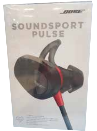
The Bose SoundSport Pulse is available at Joeten Superstore in San Jose.

Sound Disc Wireless allows people bring their favorite music wherever they go. The design is stylish and has excellent sound quality because of its superior HD sound. Cost is only $16.95.