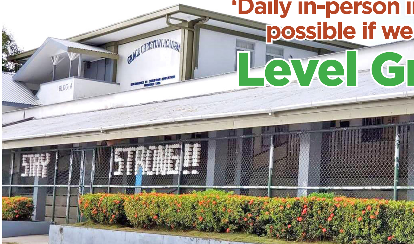
For 35 years now, Grace Christian Academy has been one of the prestigious private schools on Saipan.

"Our classes went online at the time when our community was in lockdown. However, as soon as we were permitted, we opened our doors for face-to-face instruction. ...GCA has worked closely with the COVID-19 Task Force and has been very diligent in following all necessary guidelines