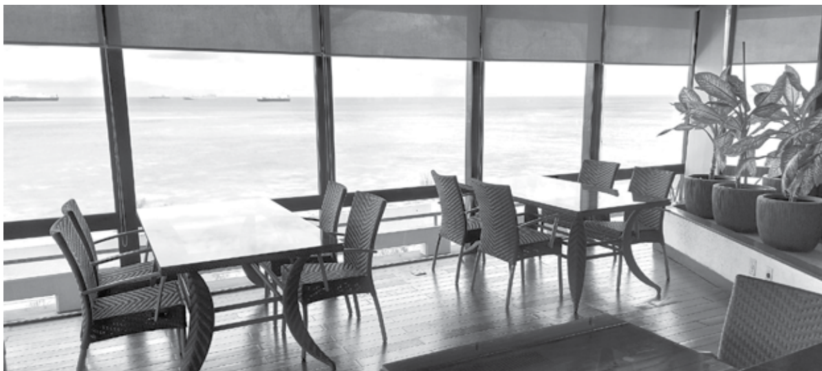
Beginning today, Dolphin Restaurant at the penthouse of Grandvrio Resort Hotel is open for lunch from 11:30am to 2pm Friday, Saturday, and Sunday.