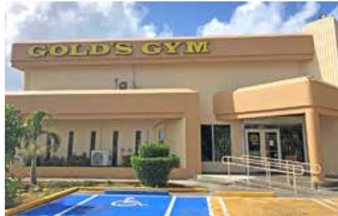
Gold's Gym in China Town.

"Our long-term members inspire me by their dedication and perseverance in making fitness a priority throughout this whole pandemic...and we keep our health and safety protocols in place. ...Members use disinfectant to clean their equipment as we have always done. Additionally, we are continuing with nightly sanitation after closing using our electrostatic sprayer," he added.