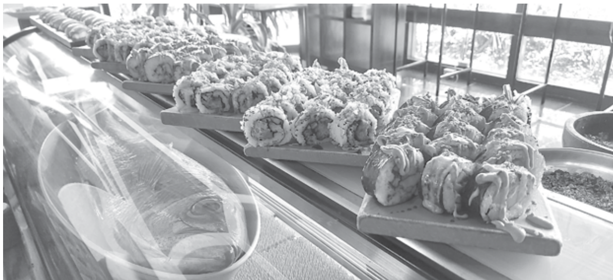
Expect a variety of food at the Hyatt Regency Saipan’s lunch and dinner buffets on the weekend featuring Kevin’s vegetable farm roll for health buffs that is made up of local vegetables.