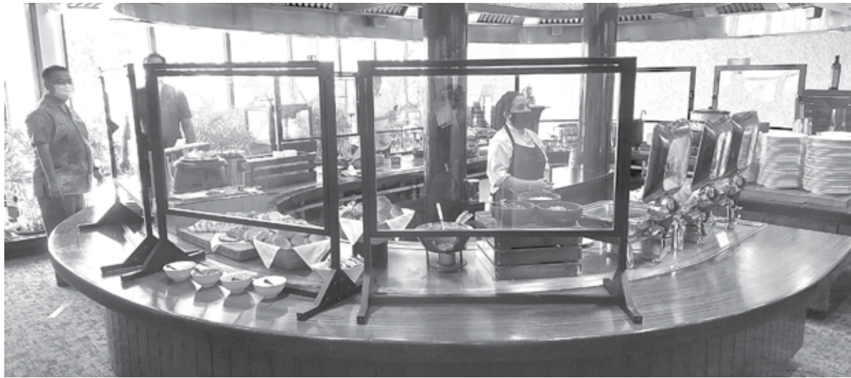
Food service stations at the Hyatt Regency Saipan’s Giovanni’s Restaurant is covered by plexiglass to maximize health and safety of both employees and customers.

“...It has been over a year that we missed having self-serve buffet style at the Hyatt. ...We still have unlimited offerings where food was brought to customer’s table but we know buffet style is really the island style, especially when celebrating special occasions. We have always wanted to bring self-serve buffet but [to do it safely]. ...After getting accreditation from the COVID-19 Task Force, [Commonwealth Healthcare Corp.], Bureau of Environmental Health, etc. we were given clearance. ...We did this concept for Father’s Day. ...This is all possible