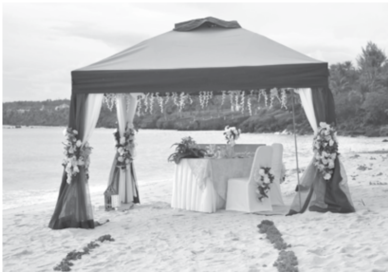
Level Green has allowed JC Cafe to open up its services for indoor and outdoor functions complete with organizing, decorating, and catering. This was a wedding anniversary set up done at Tahogna Beach on Tinian. CONTRIBUTED PHOTO

"We thank the government for doing a great job in controlling the pandemic and possible spread to the islands. We also thank the community for being united in following protocols to ensure everyone's safety. ... Even though we are at Level Green, we should remain vigilant in protecting ourselves, our family, and the people around us. At Eats Easy, we will maintain all our delivery procedures and protocols daily from 9am to 8pm for everyone's safety," he added.