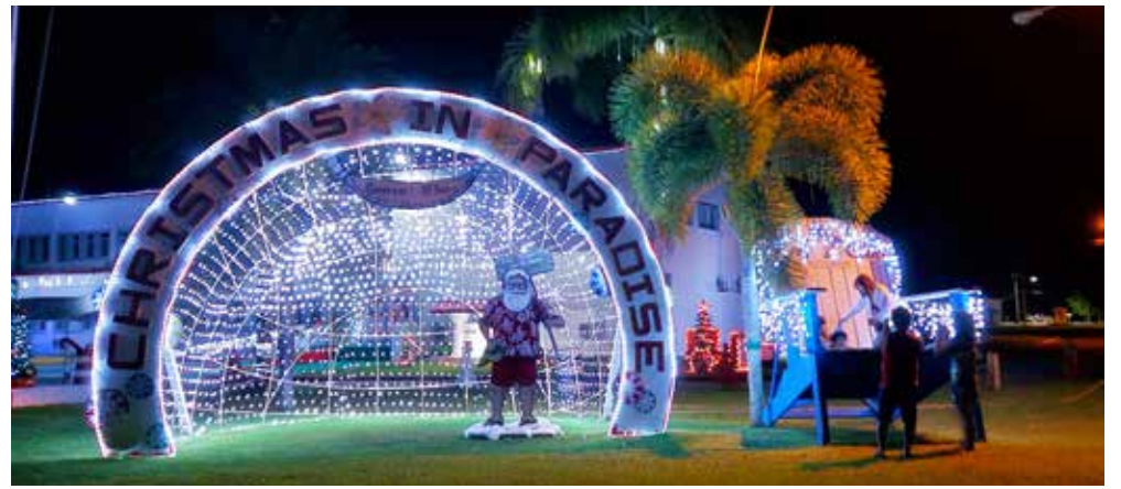
Have a photo opportunity with Santa Claus at the Christmas in Paradise display on Capital Hill.