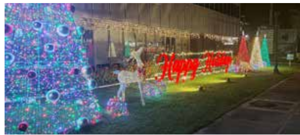
The annual Tan Siu Lin Foundation Christmas display is always a crowd drawer both for residents and tourists.