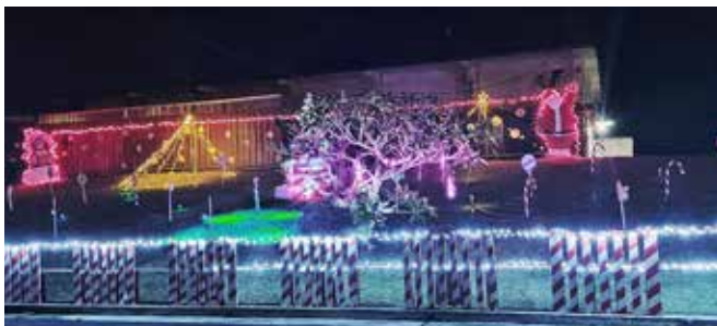
The Christmas display on the grounds of the Department of Community and Cultural Affairs on Capital Hill features the national flower of the CNMI, the plumeria.