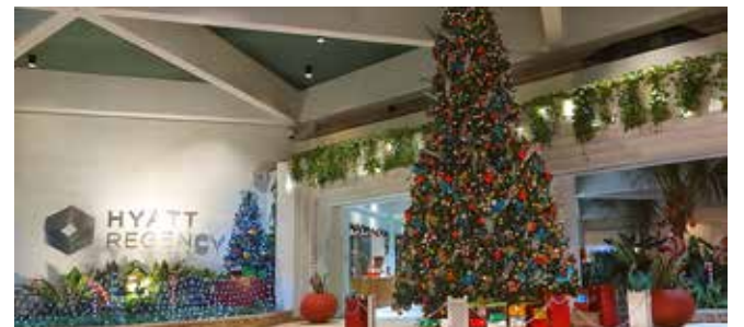
Hyatt Regency Saipan's 20-foot Christmas tree is once again on display, commemorating Christmas and the hotel's 41st anniversary on Saipan.

Unlike last year, when there were still a lot of uncertainties about the pandemic, Christmas is shiny and bright in the CNMI this year, with several Christmas light shows and displays around Saipan. The pretty and mesmerizing lights are drawing family and friends together for photographs and keepsakes of future fond memories. Every Christmas light display from Susupe to Capital Hill feature different themes, so every stop is different from the last.