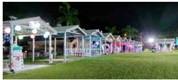
The CNMI Museum of History and Culture invited Daycare Centers to showcase Christmas displays for everyone to enjoy this year.