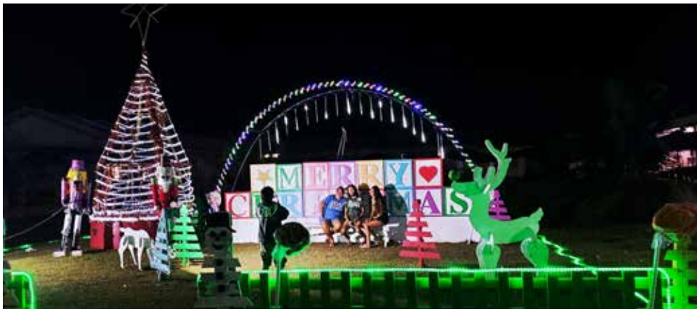
Enjoy all the traditional holiday displays at the Christmas village in Susupe.