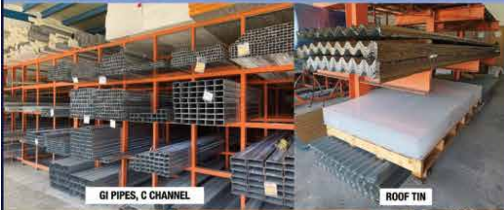
GI PIPES, C CHANNEL