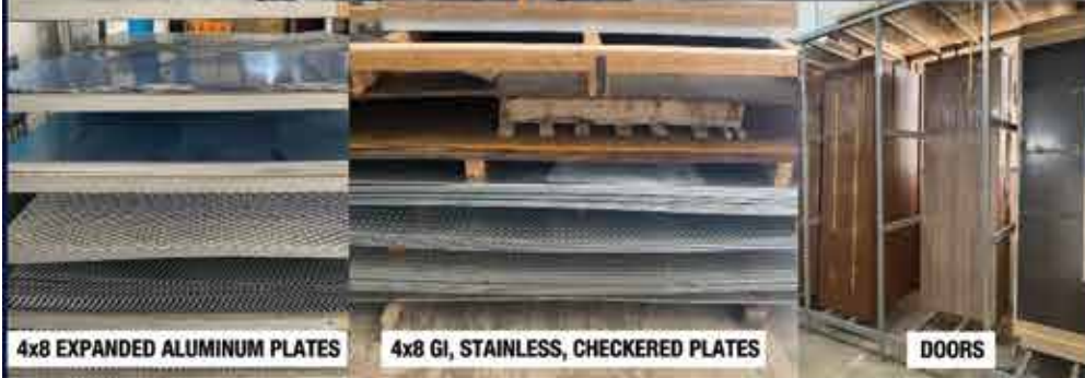
4x8 EXPANDED ALUMINUM PLATES