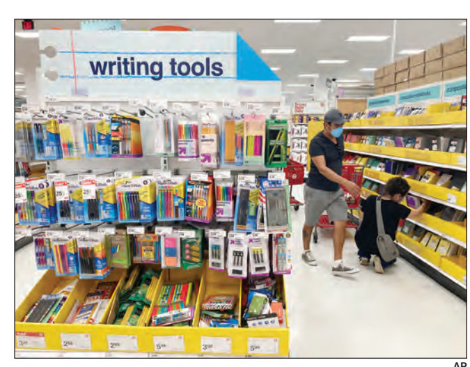
Shoppers look for school supplies deals at a Target store, July 27, 2022. in South Miami. Fla.

Workers were seeing their quality of life decline as they transitioned from arti-