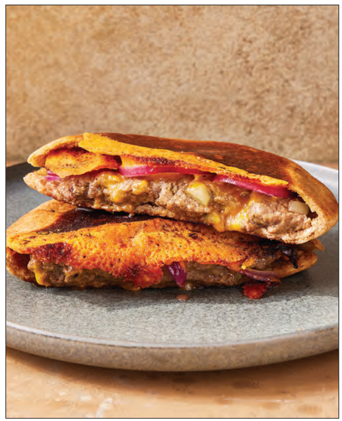
This image released by Milk Street shows a recipe for pita burgers with crisped cheese.